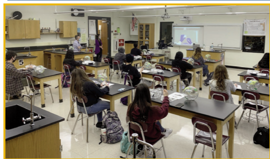
SCVTHS students take part in the Virtual Earth & Space Science Lab sponsored by Sanofi

The students seemed really excited to be doing a hands-on lab since with hybrid/remote learning, it's been difficult to have actual hands-on labs for them."